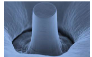
Topics common to all programs Materials sciences and energy

Further information and reference documents can be found at