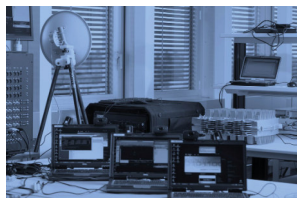
Research program 2 Communications