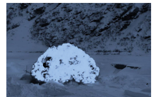
Research program 4 Impact, protection and safety