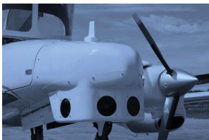
Research program 5f Unmanned Mobile Systems