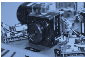
Research program 1 Reconnaissance and surveillance