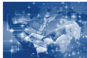
Research program 3 a + b Cyberspace / Data Science